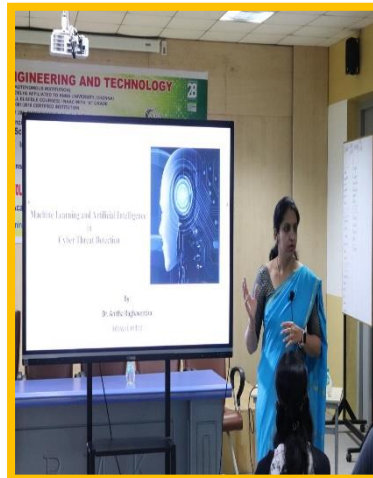
09.02.2024 Session 2: "Machine Learning and Artificial Intelligence in Cyber Threat Detection"