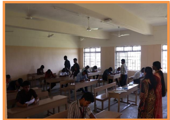
Dumb Bugs – Debugging