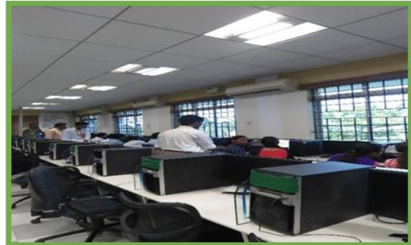
Hack Off - Capture the flag