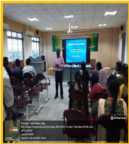
09.02.2024 Session 1: "Cloud Security Unveiled: Safeguarding Data in Cloud Environments"