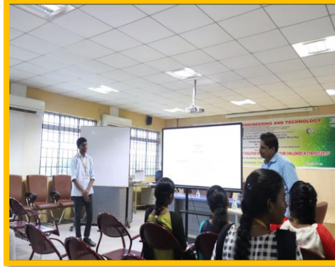
10.02.2024 Session 5: "Application Security: Safeguarding Software and Web Applications"