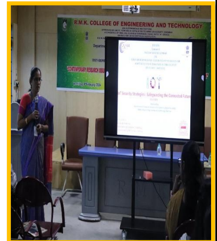
09.02.2024 Session 3: "IoT Security Strategies: Safeguarding the Connected Future"