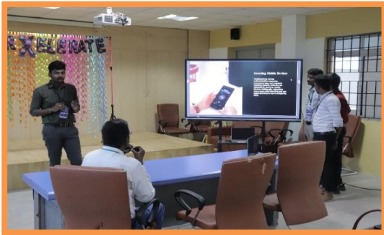
Cipher Dexterity - Paper Presentation

With 71 participants evenly distributed across all events, the symposium concluded by noon after a morning filled with dynamic discussions and competitions. The day culminated in a spirited prize distribution ceremony, where participants celebrated their achievements and contributions to the cybersecurity community.